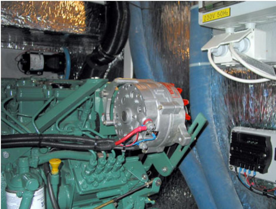
A High Output Alternator installed on separate brackets on a Volvo Penta D2-55 with external regulator on the wall after 1500 hours.

The HOA makes sure that a maximum of current is delivered to the batteries and the regulator decides in what rate, allowing for shortest possible charging time without damaging the batteries. Unfortunately, not all engine manufacturers supply their engines with an HOA-kit with an external regulator. Yanmar does, for instance, but with Volvo-Penta you have to find an external supplier for second brackets, HOA and regulator (e.g. by Electromarine in Norway).