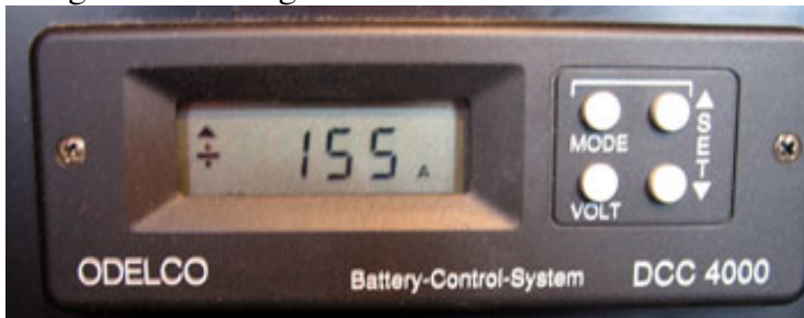
The Batteries are charged with 155A!

During “Bulk”, every possible last bit of power is stuffed into the batteries. On your amphour-meter, you will see how the current (A) is kept at its maximum during the entire “Bulk”-phase, thanks to the intelligent external regulator, despite the fact that voltage is increasing.