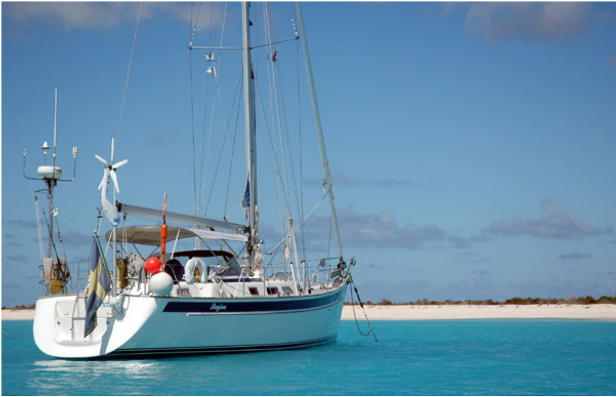
Regina, self-sufficient with power at anchor in Barbuda, Caribbean