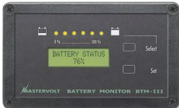
Frurther to current, voltage and amphours, the Ah-meter can also show the battery status in percent.

Lets take the easy part first: Discharging. Here, you read the current, which is drained from the battery (measured in amps, A). Is everything switched off, it should read 0A. If not, you might have a leakage, like a lamp that is left on. Switching on applications one by one, the current increases while you may observe how much the individual equipment actually is consuming. So far, everything should be as clear as an anchorage in the Caribbean.