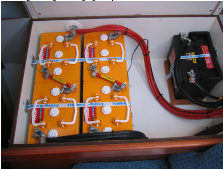
A professional battery installation: starter battery in black (to the right) and deep-cycle batteries in yellow (to the left).

How about the voltage then? During discharging, you should disregard from the voltage, since it is varying heavily depending on the load and hence is misleading. Many boats unfortunately only have a volt-meter so their owners try to get an indication of the battery status from its reading. If you wish to use a volt-meter, you need to switch off everything onboard first, letting the batteries rest for at least half an hour and then very carefully measure the voltage, something an analogue instrument is not capable in doing. So: Forget the voltage during discharging is my advice.