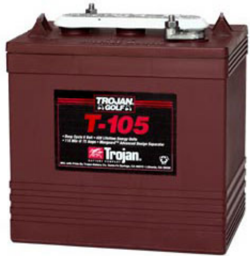
A true deep-cycle battery also found in numerous golf-carts.

The fact that many sailors seem to do all right with starter batteries for service, nevertheless, can only result from frequent access to shore power, frequent motoring or thanks to the fact that discharging is made to no more than 20-30% of the battery’s capacity. If you are among these, you may stop reading here. This article is for the sailor who likes to anchor. Learn to read amps, volts and amphours on your amphour-meter, and you will soon be able to build an effective charging system. At the same time, you can react immediately, should something not be as usual.