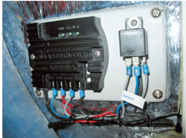
The "brain": The external regulator

hand, makes sure that maximum of current is lead to the batteries without damaging them. Charging is often done in three steps: “Bulk”, “Absorption” and “Float”.