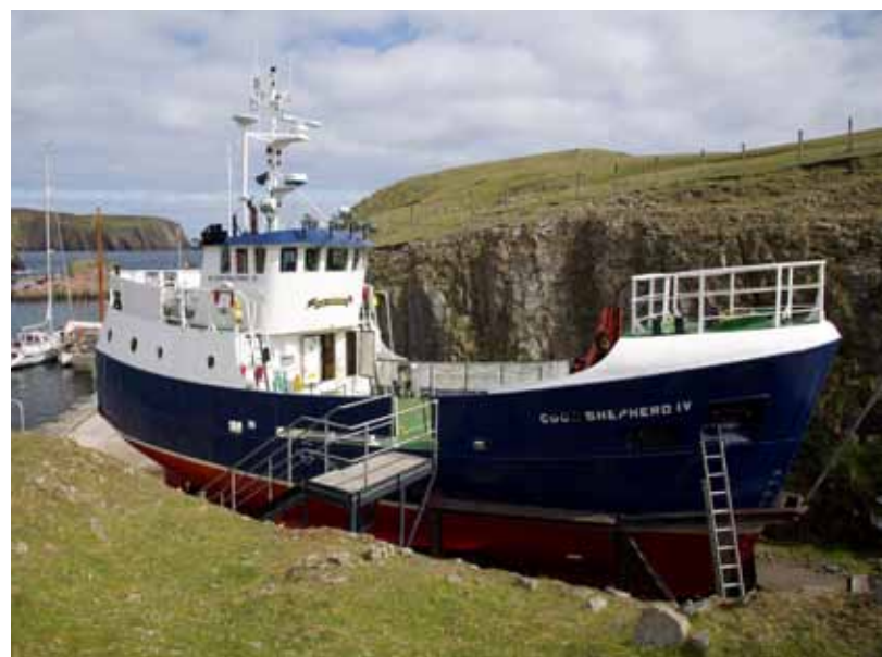
▲ Above: the fog that often envelops Fair Isle adds to its air of mysticism. Left, the Good Shepherd IV , the island's ferry and one of its lifelines. Right, 'The Ferry' – as it is known – docked at North Haven, the island's safest harbour

South Harbour, is foul with rocks and must be approached with extreme caution.