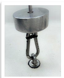
Extra lifting eye on floor