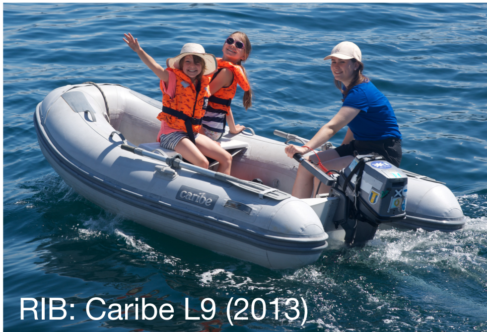
RIB: Caribe L9 (2013)