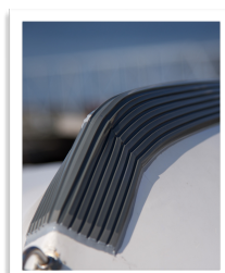
Anti-scratch GatorSkin on keel