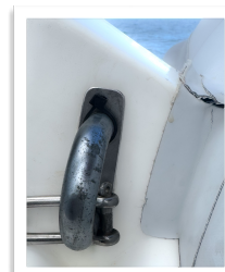
Extra strong ring to lock the dinghy