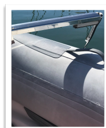
Anti-chafing patches on tubes (protect for davits)

Lying in Marina Coruña A Coruña, Spain Leon Schulz leon@ReginaSailing.com +356-999 18400