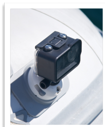
Navimount fittings (e.g. for nav lights or GoPro camera)